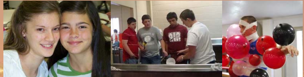
Sunset Hill Camp "Preserving Our Pentecostal Heritage"